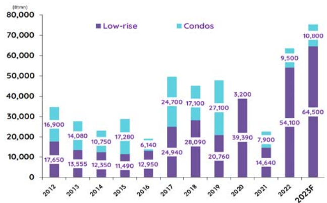
Figure 2: Project Launch in 2023F will be a new high