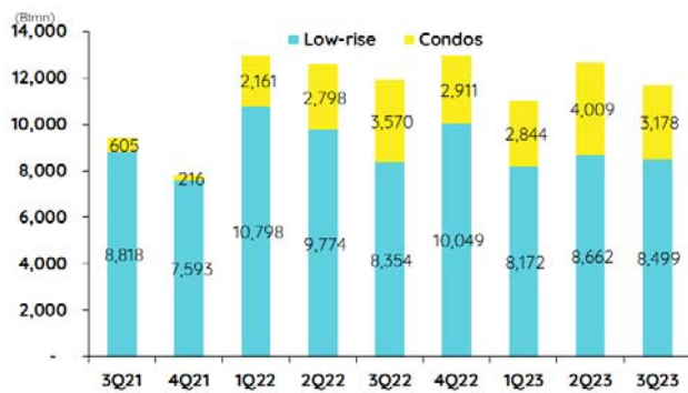
Figure 3: Presales (Quarter) 3Q21-3Q23